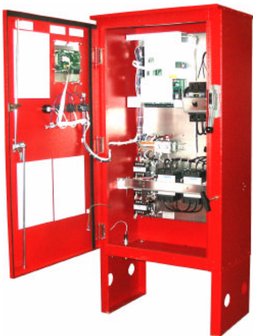
MP430 Fire Pump Controller

The controller is completely wired, assembled, and tested at the factory before shipment, and ready for immediate installation.