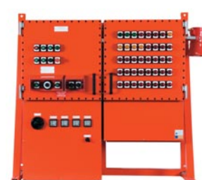
PLC BASED DIESEL PANEL TO EEx'p'