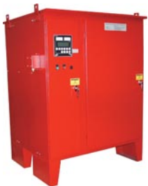
MP600, HIGH VOLTAGE DIRECT ON LINE FM APPROVED, UL LISTED