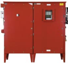
MP700, SOFT STARTER TO EEx'p'