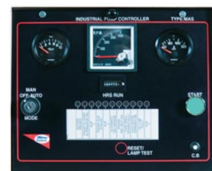
EFP/MAS, INDUSTRIAL DIESEL ENGINE CONTROLLER