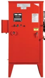
MP300, DIRECT ON LINE, OPTIONAL MTS FM APPROVED, UL LISTED