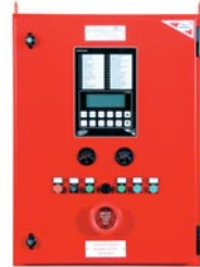
CEPREVEN DIESEL (SPANISH)