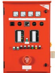
APSAD DIESEL CONTROLLER