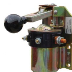
DC EMERGENCY START SOLENOIDS