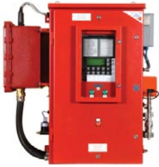
FD4e DIESEL PANEL TO EEx'p'