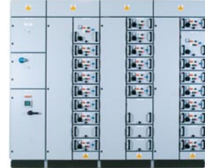
MOTOR CONTROL CENTRES