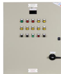
WATER MIST ELECTRIC MOTOR