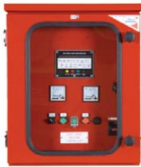
LPC/EN12845 IP55 DIESEL