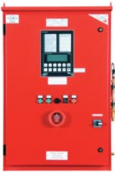
FD4e, DIESEL FM APPROVED, UL LISTED