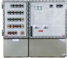
DUAL FOAM PUMP TO EEx'de'