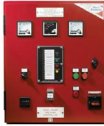
LPC/EN12845, IP54 DIESEL