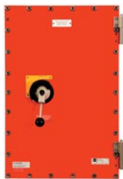
DC ISOLATION UNIT TO EEx'd'