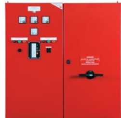
UNE-EN12845 AND CEPREVEN ELECTRIC MOTOR CONTROLLERS