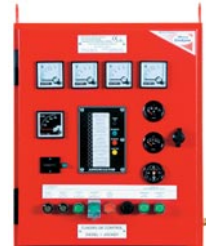
UNE-EN12845 DIESEL (SPANISH)